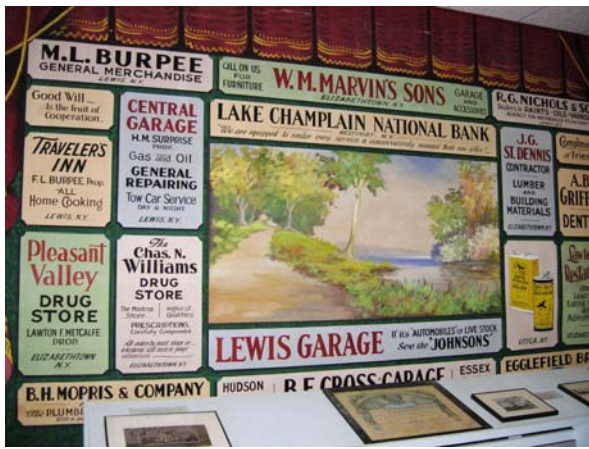
Above: Example of an Historic Theater Scenery Curtain from Elizabethtown and Lewis NY. See article below. Your Grange may have one or more of these scenic historic paintings. Please check.