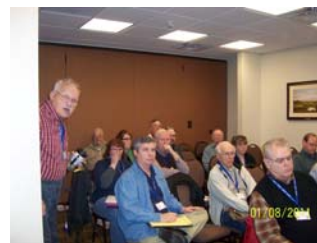
Communication, Public Relations workshop attendees.

Workshops were presented for Lecturers, Masters, Legislative Directors, Communication Directors, Membership Directors, Youth and Junior Directors, Community Service Directors and Family Activity Directors. In addition there were breakout sessions where plans were made for several activities in the region, including the Northeast Lecturers Conference, The